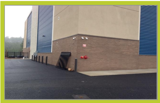
Photo of Exterior IP Minidome cameras that cover parking lots, drive aisles, gates and keypads.

Spacemax is the Southeast regional, self-storage division of Childress Klein properties. Spacemax prides themselves on high-end climate controlled storage with customer satisfaction in mind. Their facilities include a wide variety of storage sizes, covered unloading areas, controlled access and a broad array of security systems.